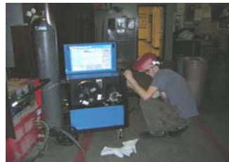
A student practices welding at the Workforce Development Center.

A strong partnership between the State, employers, educators, parents and students requires mutual commitment, high standards and clear expectations. The Chamber of Commerce, Department of Labor and Workforce Development, School District plus the TALENTS Program are dedicated to establishing and sustaining such standards.